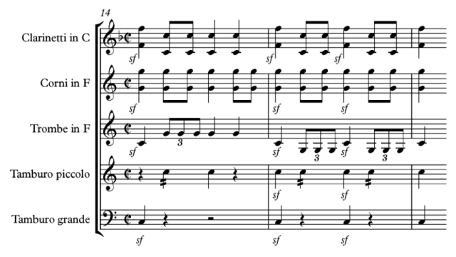
Musical example 2: March WoO 18, mm. 14-16

More infrequently encountered but more directly related to the main motive of the fifth Symphony is the triplet anacrusis figure, an example of which can be found in the March WoO 18: