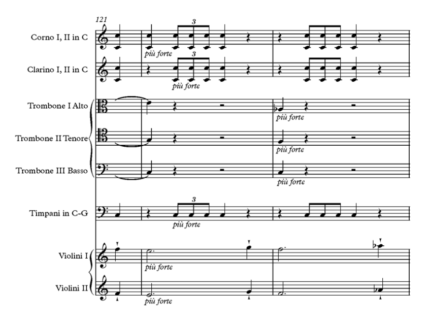
Musical example 4: Fifth Symphony, Finale, mm. 121-123

[185] This sort of march figure can be found in the symphonic literature before Beethoven.<sup>59</sup> In the Fifth Symphony, Beethoven only gradually lets the rhythm of the main motive take on the function of a festive-martial accompanying rhythm. This happens for the first time at the end of the Andante (mm. 240–242). Starting in m. 19 of the third movement, the motive appears in a form in which it already has a fanfare or signal-like effect; however, at this point it does not yet assume the characteristic accompanying role. This first occurs in the fourth movement. In a certain way, one can thus say that only in the moment in the last movement when this figure assumes its stereotypical accompanying role and fades into the background of the musical events does it comes into its own (this can be found in several passages, in particular: mm. 48–50, 122–132, 257–259 and 261):